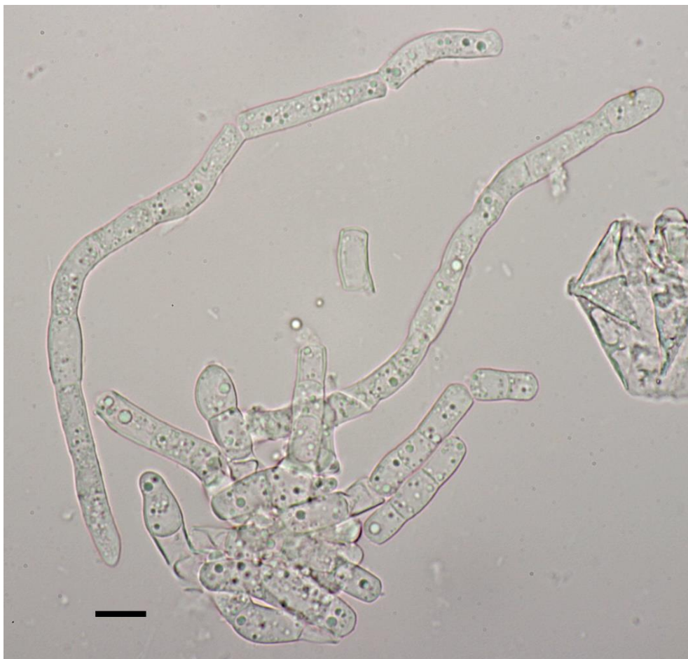
Fig. 2: Thedgonia bellocensis . Straight to curved, hyaline conidiophores and cylindrical conidia. Bar = 10 \mu m.